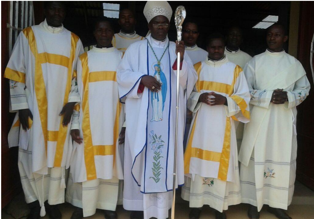
Adiyakoni bashya Diyosezi yungutse bakikije Umwepiskopi batuwe Umubyeyi :