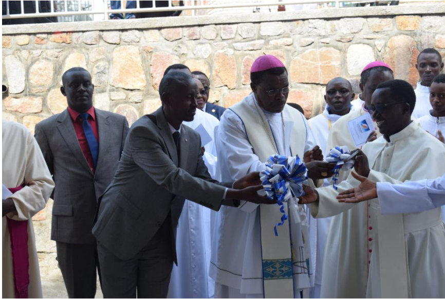
Umwepiskopi yayifunguye ku mugaragaro ayiha n'umugisha