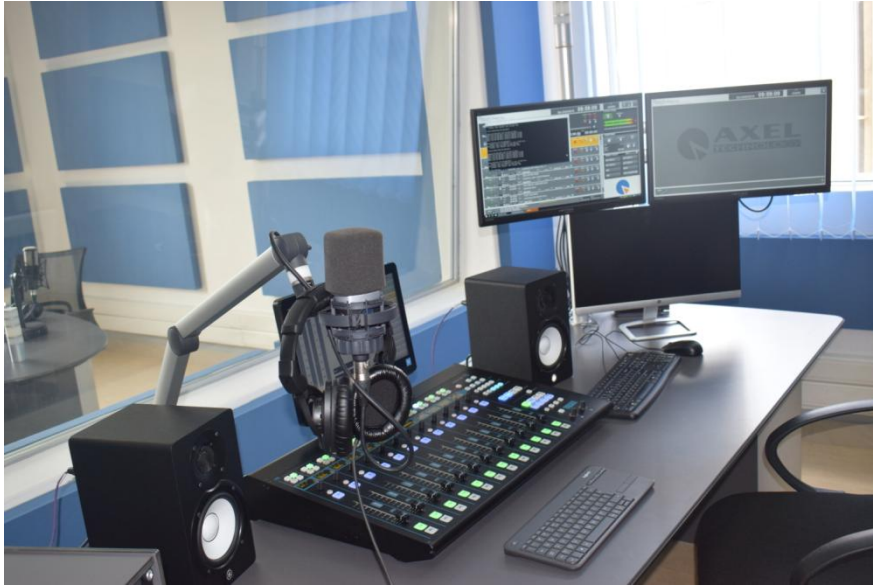
Bimwe mu bikoresho byayo