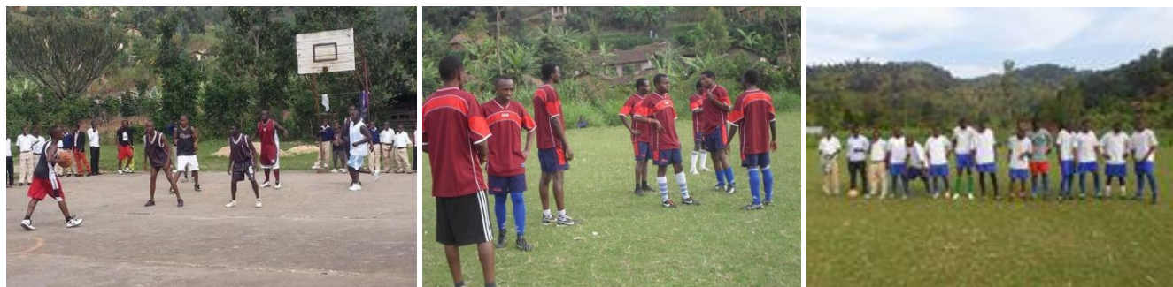
(ibumoso) basket amakipe yombi yacikiranye (hagati) ikipe y'abize mu iseminari kera (iburyo) ikipe y'abasemari bato

Uwo muni ukaba waratangijwe n'imikino itandukanye; basketball na volleyball bikaba byarangiye abasemari batoya batsinze bakuru babo ariko bitari cyane naho football yo bakaba barangiye ibitego 3-3. Iyo mikino yose ikaba yaranzwe n'ishyamba ryinshi ku mpande zombi.