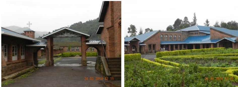
Iseminari nto ya Nyundo nyuma y'isanwa ry'igice kimwe cyayo (Saint Pie X)

Impamvu nyamukuru y'urwo ruzinduko rumaze kuba akamenyero, iba ari ugusura no gusabana na barumuna babo, hagamijwe cyane cyane kwimakaza ubuvandimwe mu barerewe muri urwo rugo mu bihe bitandukanye.